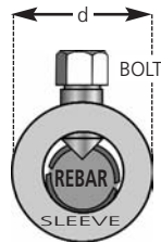
Side view of coupler